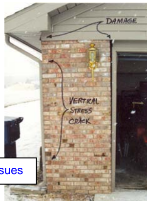
DAMAGE VERTICAL STRESS CRACK