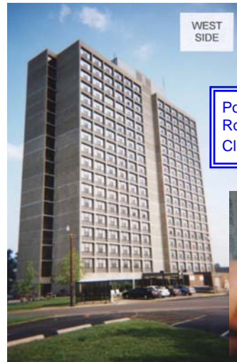
Post Tornado Structural Assessment Roosevelt House I & II, O'boro, KY Client: Monroe Guarantee Ins. Co.

Client needs something A building, bridge, access, or something that doesn't exist or needs improvement or replacement.